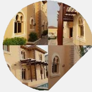
Villa Paint Works