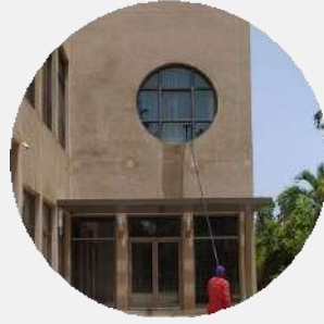
Villa Windows Cleaning