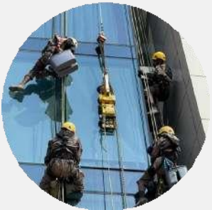
Glass Installation and Replacement