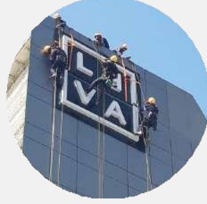
Sign board & Facade Light Installation