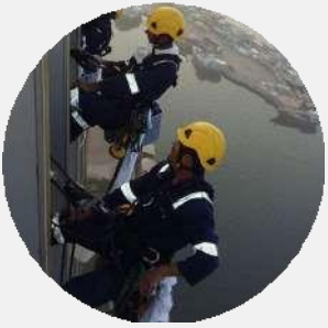
Rope Access Work